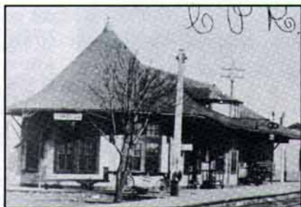
C.P.R. Station, c. 1910

The Toronto Grey and Bruce Railway built a line into Orangeville in 1871. This station was originally built in 1909 at the rail yard on Town Line. It was moved here in 1989 and converted to commercial use. The distinctive conical roof