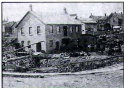
Armstrong Foundry, c. 1900

Continue south on Wellington, pausing at the bridge over the Mill Creek.