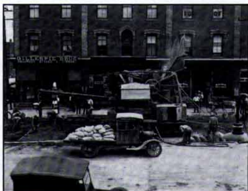
Road paving, Jackson Block, c.1921

Built during 1874-5, a period of great growth and construction on Broadway, this is one of the finest surviving examples of commercial architecture. Note the grouping of the windows on the second and third floors, the ornate cornice moulding and lintels over the windows. Thomas Jackson was a saddler who moved to Orangeville in 1853