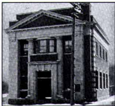
Bank of Commerce, c. 1906

and acquired properties in this area. After fires in 1872 and 1873 destroyed many buildings in the area, a new block was constructed bearing his name.