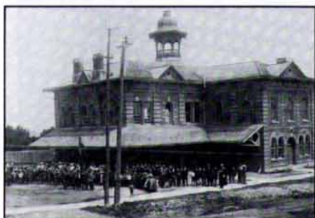
Orangeville Town Hall and market, c. 1900

Although no longer in use as a farmers' market, you can see evidence of this function in the large stone steer heads which decorate the window lintels in the old market wing. In fact, during the period 1875 - 1890, the market was the only legal place to sell meat in town.