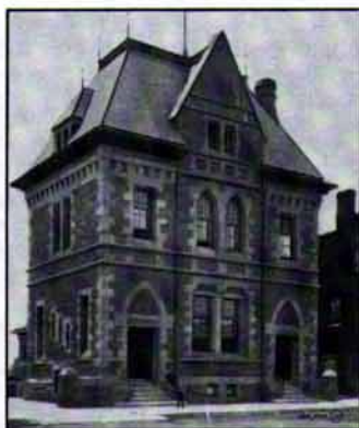
Post Office, c. 1900

The post office, which stood on this site until the mid 1960s, was a large, two-storey structure, built of limestone quarried in the Hockley Valley. It featured a steeply pitched roof and was built in the Chateau style, popular at the time for federal buildings. Many post offices in Canada were built from similar plans. The loss of this building helped many Orangeville residents to appreciate their architectural heritage. At one point a proposal to demolish the Town Hall was put forward but it was quickly stopped.