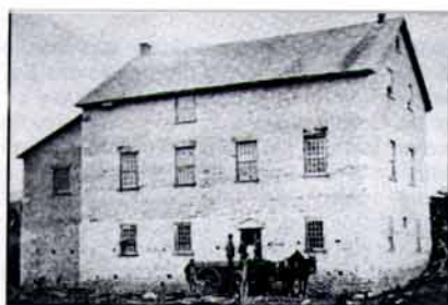
Jull Mill, c. 1875