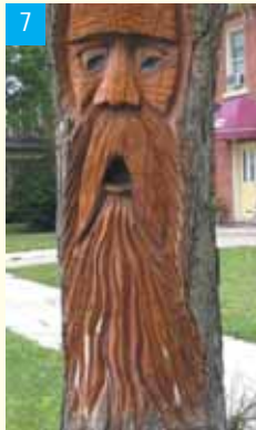
267 Broadway Subject: Tree Spirit Artist: Colin Partridge