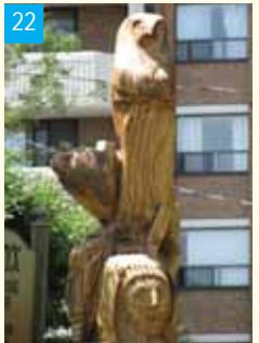
48 First Street Subject: Canadian Fighting Spirit (dedicated to the Canadian troops fighting in Afghanistan) Artist: Murray Berger