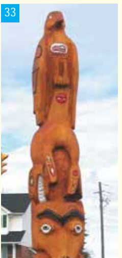
Blind Line (south of College Avenue) Subject: Totem Pole Artist: Billy Watterson