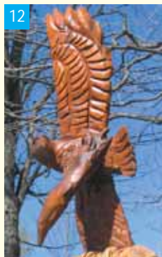
293 Broadway Subject: The Eagle & Salmon Artist: Jim Menken Private sponsor