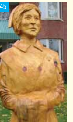
32 First Street Subject: The Nurse Artist: Jim Menken Background: The Nurse marked the IODE's 100th anniversary in 2007, and sits in front of the former hospital. Sponsored by the IODE