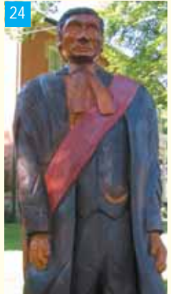
62 Zina Street Subject: The Judge Artist: Jim Menken