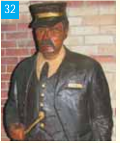
Town Line (in train station) Subject: The Conductor Artist: Jim Menken