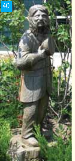
390 Centre Street Subject: First Police Chief Artist: anonymous