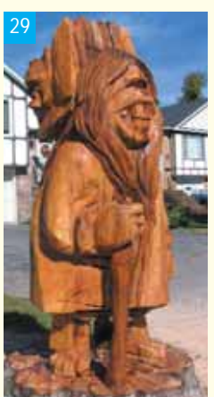
72 Town Line Subject: Troll Artist: Walter vanderWindt