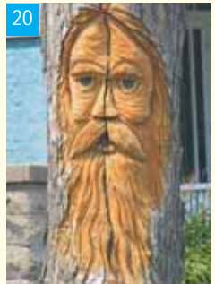
18 First Street Subject: Tree Spirit Artist: Colin Partridge