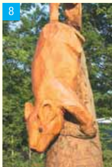
315 Broadway Subject: The Mouse Artist: Walter vanderWindt Background: A mouse heads down the tree stump to reach some berries at the bottom.