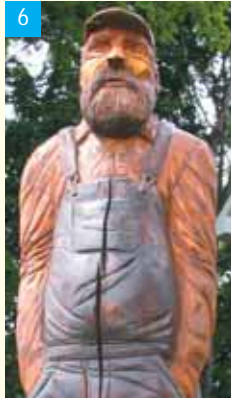
295A Broadway Subject: The Farmer Artist: Jim Menken Background: The Farmer represents the area's agricultural background.