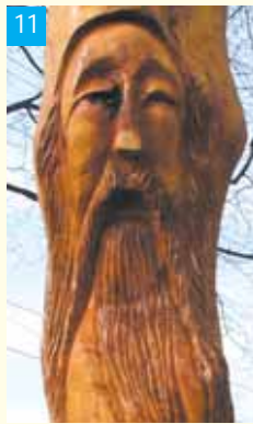
297 Broadway Subject: Braided rope with faces Artist: Jeff Waters