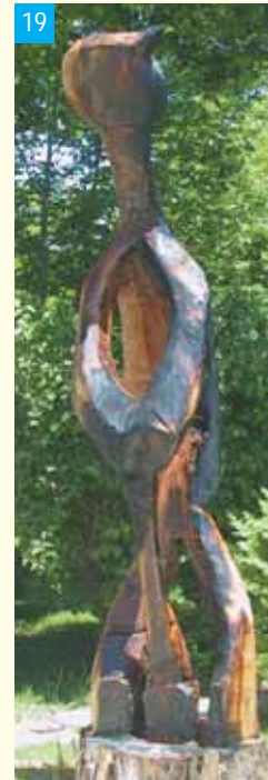
First Street (at First Avenue) Subject: "An Axe to Grind" Artist: Walter vanderWindt Background: Abstract sculpture represents the working man, depicted by a stick figure with an axe.