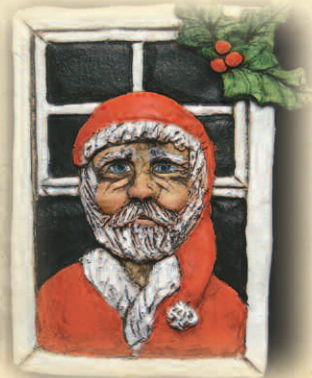
One-of-a-kind creations in Caledon East (Brenda Newton Clay Studio)

Sunday, December 31st Downtown Orangeville First Night New Year's Eve Celebration