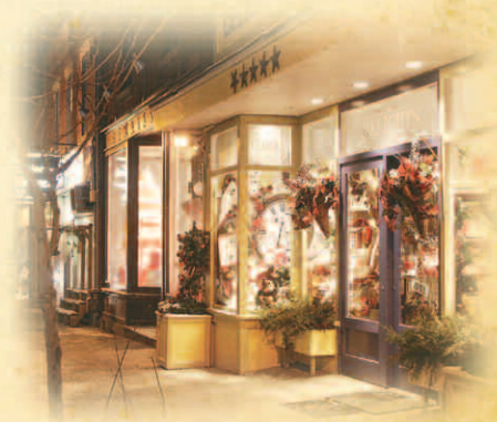
Erin's Window Wonderland