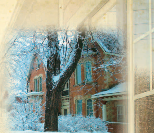
Snow-lined street in Downtown Orangeville