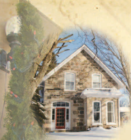
Snow blankets historic Shelburne

A Window Wonderland celebrates the magic of the season in downtown Erin . On Friday November 17, at precisely 6 p.m. bells in the church steeples ring out and that joyous tone echoes 'round the village. At that moment, merchants from one end of town to the other draw back the curtains and welcome Christmas... their windows sparkling with the season. Each has a different view – bakery, fishmonger, book store, gourmet and decorator shops, hardware stores, ice cream parlour, grocery store... all see Christmas in their own ways... and the downtown walk is magical.