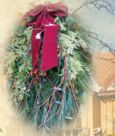
Nature's wreaths grow all around us