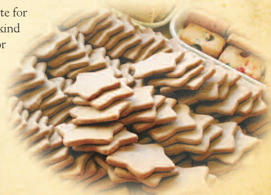
Homemade treats from our village bakeries