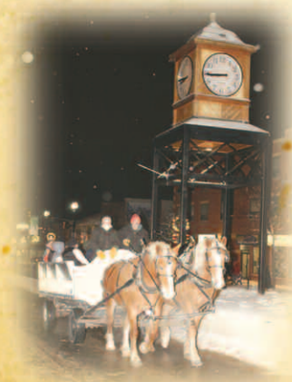
Horse-drawn ride in Orangeville

Snow falls in an evening on Broadway, and plumps up the cars that are parked there. The warmth of the season spills from store windows and someone is humming a carol. In the windows above the stores, a Christmas tree shines back at the night sky. Blink and for a moment you could be looking back a century or more... the streetlamps could be gaslights and the heritage buildings new.